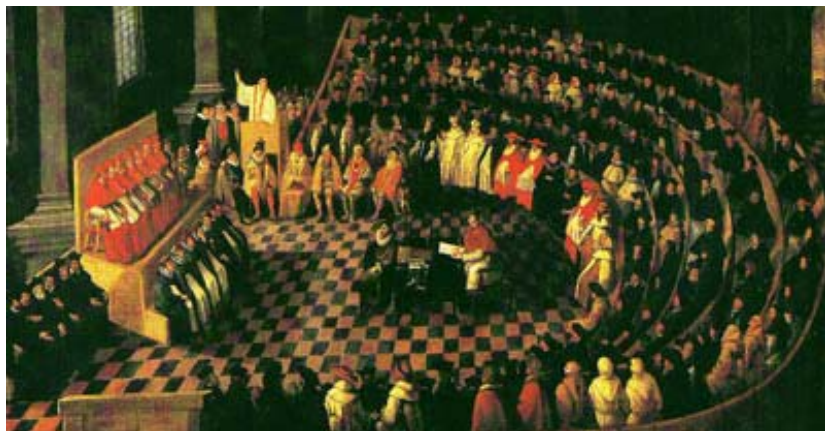
The Council of Trent

The course will culminate in the writing and presentation of a major research paper.