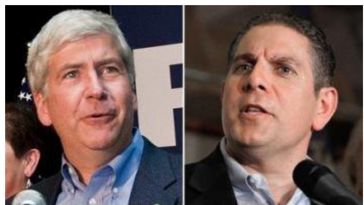
Rick Snyder, Virg Bernero.